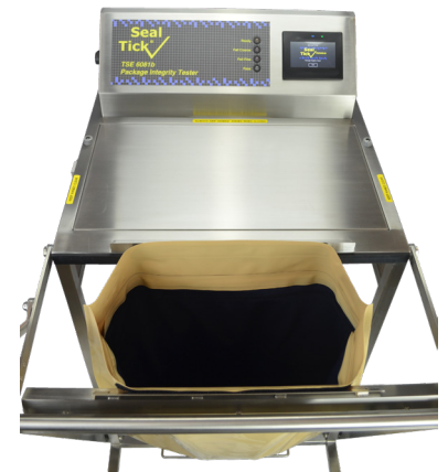
TSE6081b in open position. Closing the handle starts the test cycle

All specifications subject to change without notice